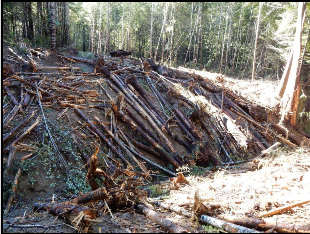
Figure 4 Road decommissioning/ restoration project