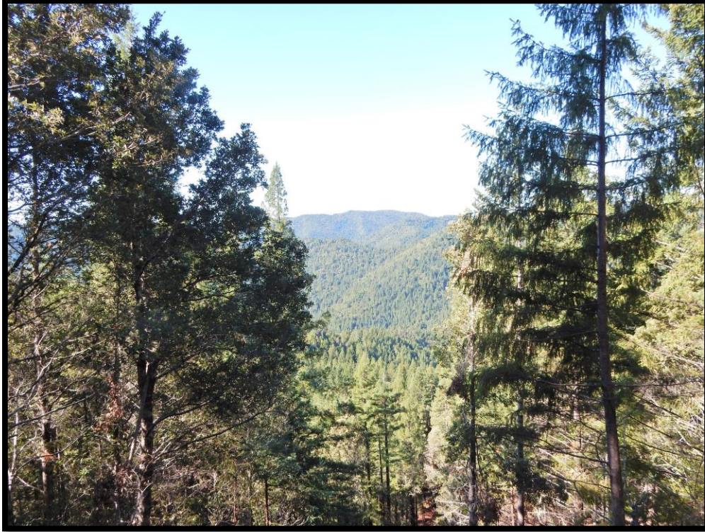
Figure 3 – Post Harvest