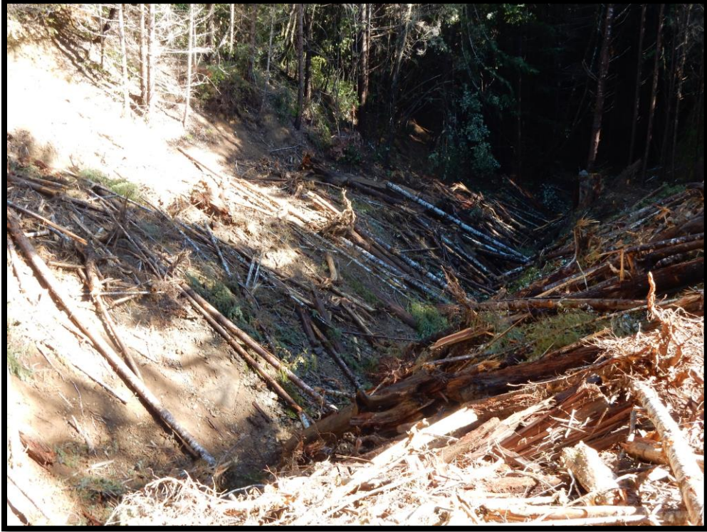
Figure 1 – Road decommissioning/ restoration project.