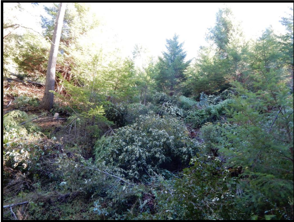
Figure 2 – Recent Timber Stand Improvement Project